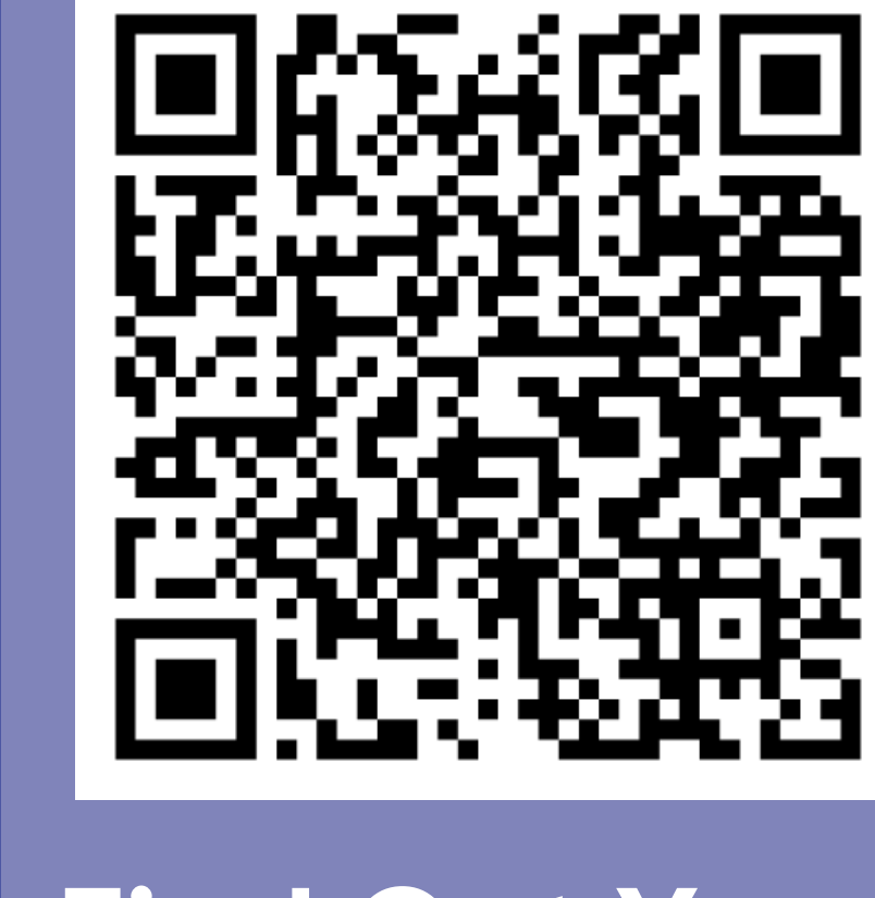
Find Out Your Eligibility